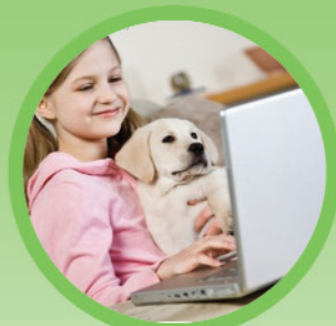
VIEW LESSON AT HOME

Lesson content automatically displays on OURlesson website.