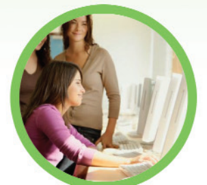
VIEW LESSON IN SCHOOL